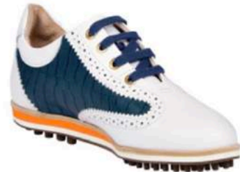
PRATO - Ladies shoe - white/crocoprint med blue