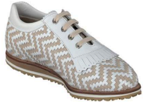
BELLAGIO - Ladies shoe - beige/white