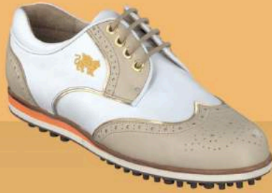
ISABELLA - beige/white