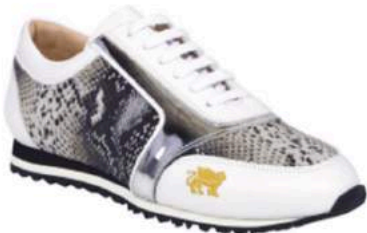
UDINE - Ladies shie - white/silver/snakepring