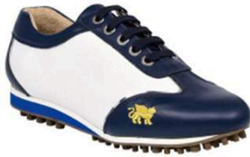
ASCOLI - Ladies shoe - navy blue/white white

Aerogreen ladies golf shoes are available in EU sizes from 36-42, and also in half sizes .