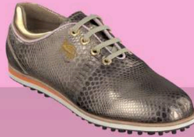
MONZA - bronze snakeprint