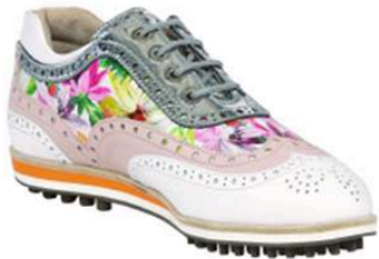
FIORE - Ladies shoe - white/pink/silver/flowerprint