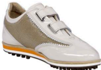
FRASCATI - Ladies shoe - beige patent/lizardprint light brown