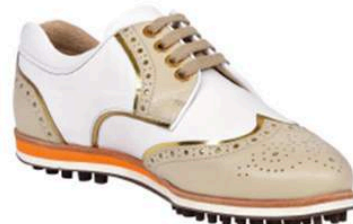
ISABELLA - Ladies shoe - beige/white