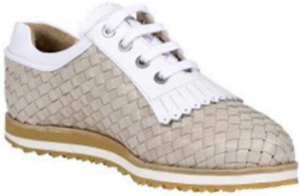
ARCO - Ladies shoe - beige/white

Aerogreen ladies golf shoes are available in EU sizes from 36-42, and also in half sizes .