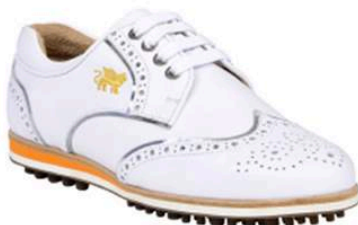
ISABELLA - Ladies shoe - white