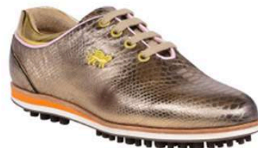
MONZA - Ladies shoe - bronze snakeprint