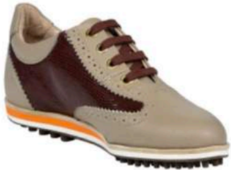
PRATO - Ladies shoe - beige/Lizardprint brown patent