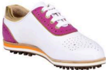
SABRINA - Ladies shoe - white/fuchsia