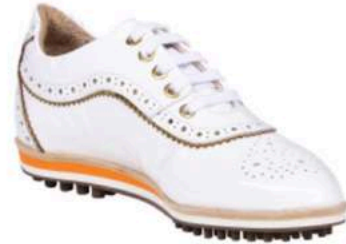
POSITANO - Ladies shoe - white patent/gold