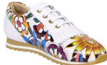
FLOWER - Ladies shoe flowerprint/white