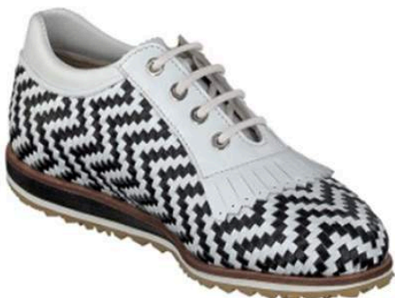
BELLAGIO - Ladies shoe - black/white