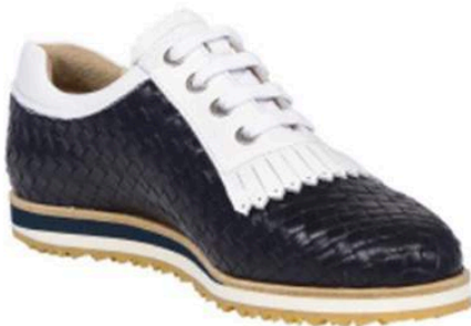
ARCO - Ladies shoe - navy blue/white