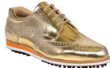
TRENTO - Ladies shoe - gold