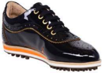
POSITANO - Ladies shoe - black patent/gold