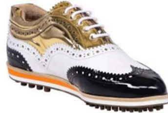
BARDOLINO - Ladies shoe - white/gold/black patent