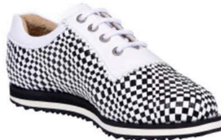
CESENA - Ladies shoe - white/black