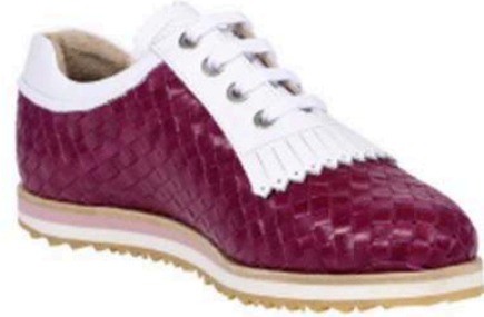
ARCO - Ladies shoe - wine/white